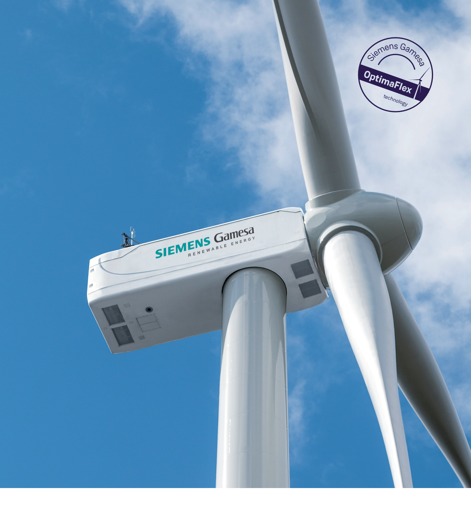
SG 3.4-132 The most profitable product in its segment